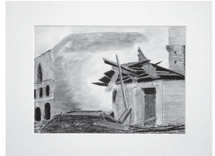
"Full Hit" 2008, charcoal, 20x30, inspired by photos of Hilde Brinkmann-Schröder