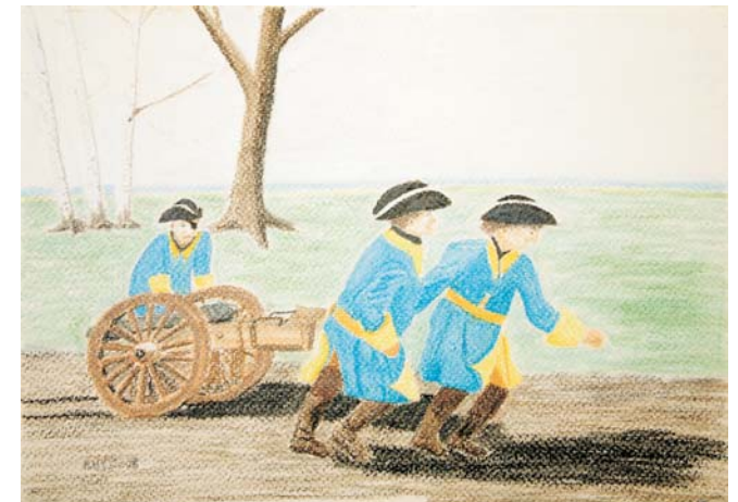
"Mystery of War", a sketch for a bigger work 2008, pastel on paper, 20x30