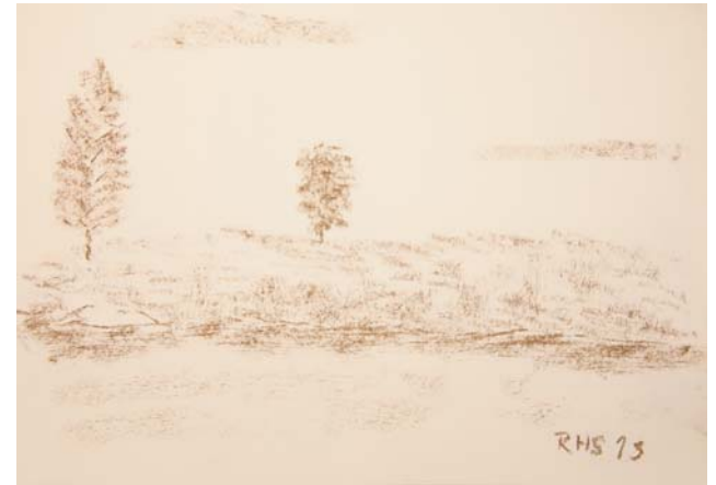
"Trees at the River" 2013, red chalk, 20x30