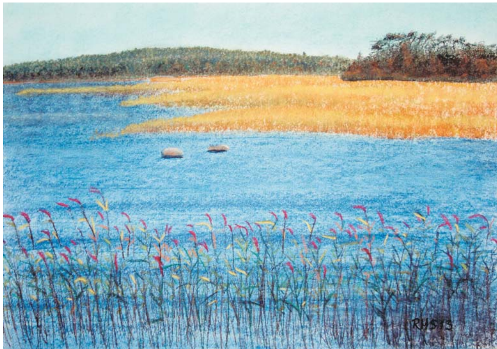
"Stranden av Sandholmen" 2013, pastel, 30x40