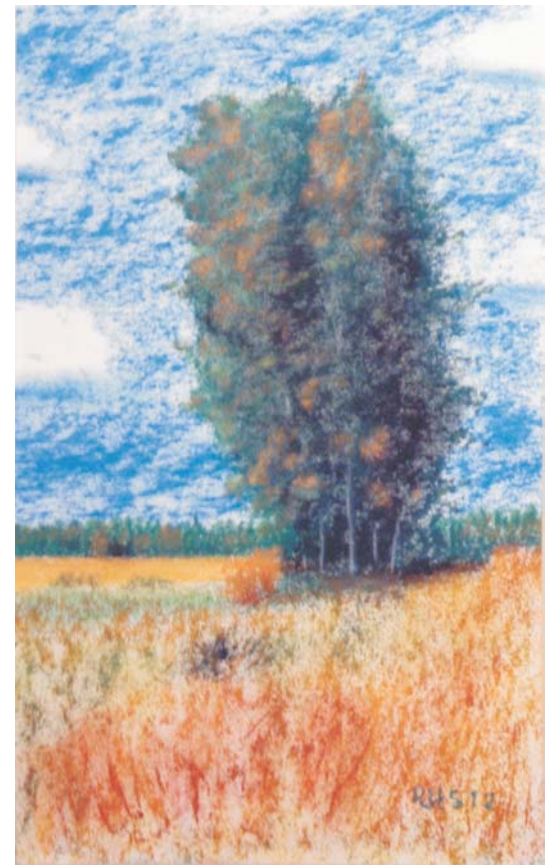
"Autumn Arrives" 2012, pastel, 30x20