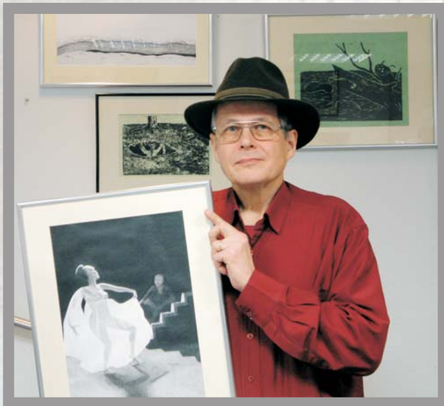
Salome and Herod, pencil 2008

An Art Exhibition in Stockholm, Galleri Ängel, October 2013