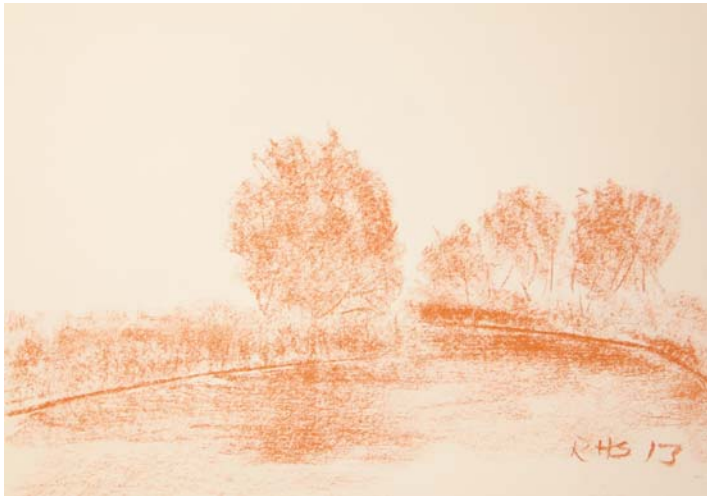
"Bushes at the River" 2013, red chalk, 20x30