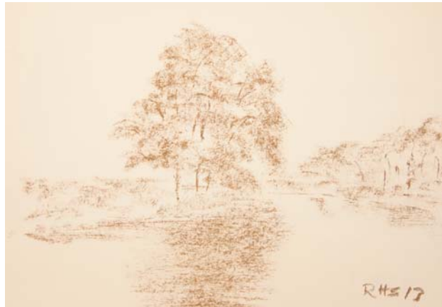
"Willow Tree at the River" 2013, red chalk, 20x30