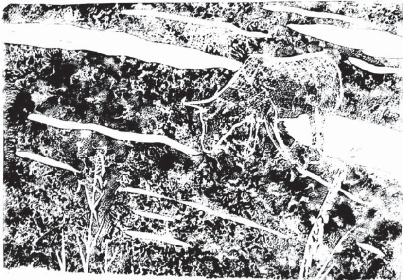
"Får" 2013, monotypia, 20x30