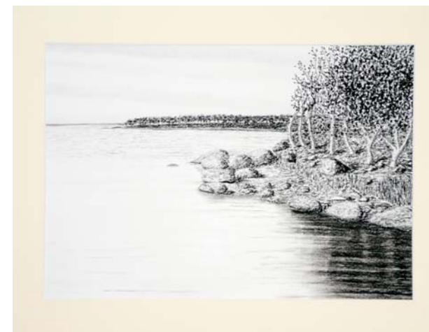
"Lake I" 2010, charcoal, 30x40

Group Finn Sixpack was established in 2010 to promote Finnish art in international art battlefields. The first target region was Taiwan where it exhibited in December 2011. In December 2012 was a similar exhibition in Taiwan with the original group of six, augmented to 15 artists. The next international exhibition will be in November 2013 in Taiwan with 11 artists of the group, consisting of the following 15 persons at this writing: