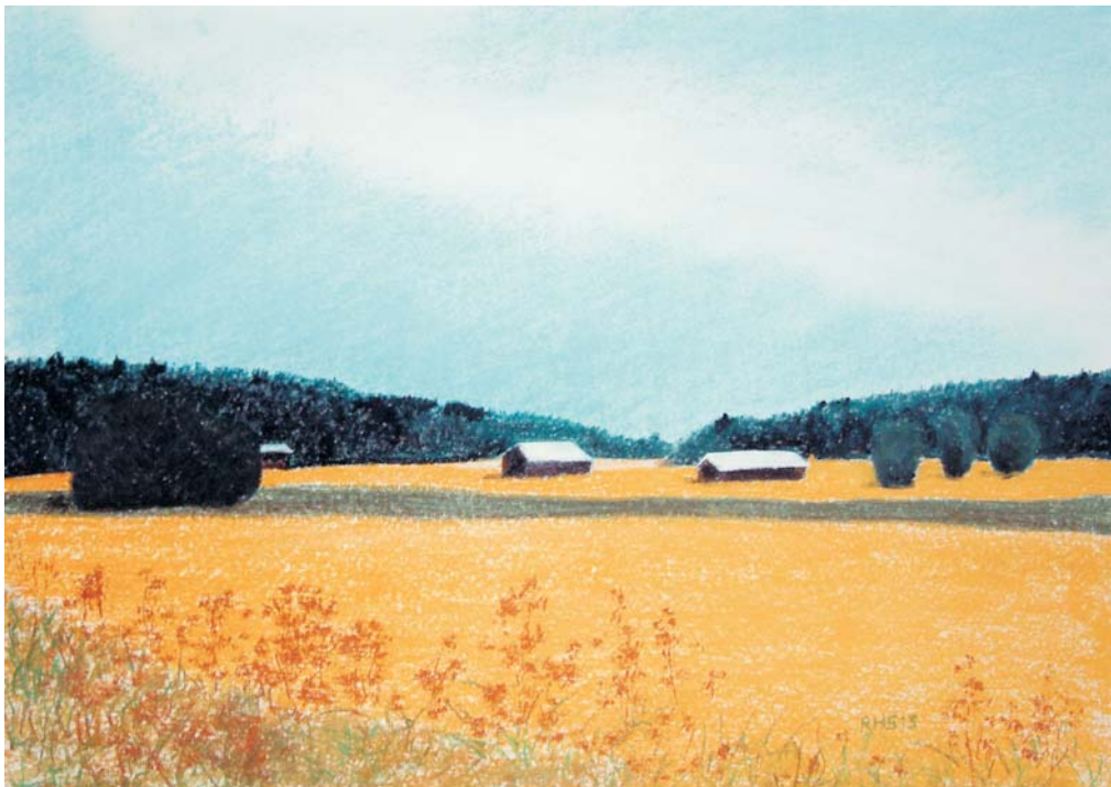
"Sibbo" 2013, pastel on paper, 30x40