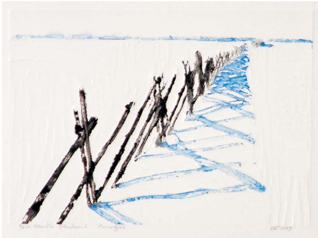
"Fence in the Snow II" 2009, monotypia, 20x30

In spite of being an impressionist, he adds symbolism to his art which is mostly about nature and man's relation to it. Environmental issues have been in his working focus since the beginning.