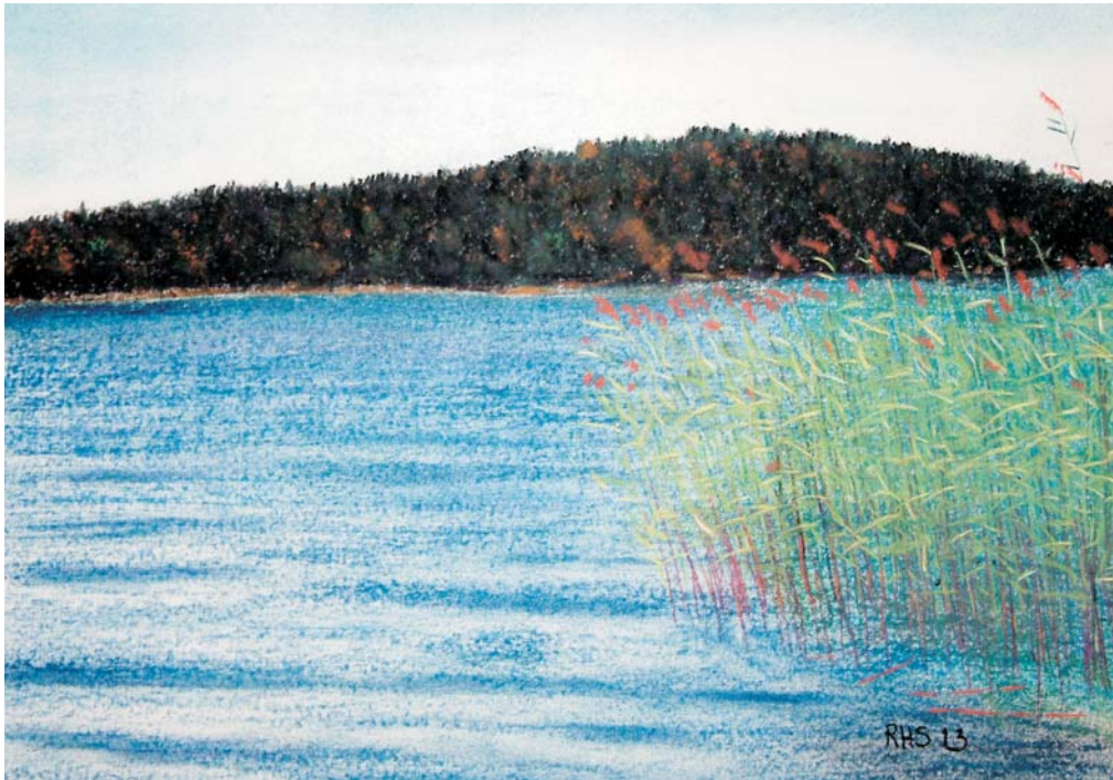
"Pernä" 2013, pastel on paper, 30x40