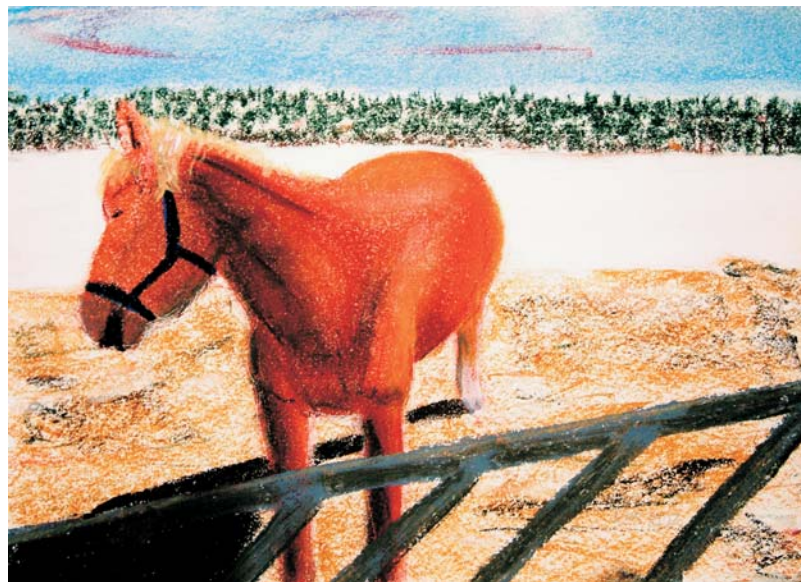
"Red Horse in Springtime" 2013, pastel on paper, 20x30