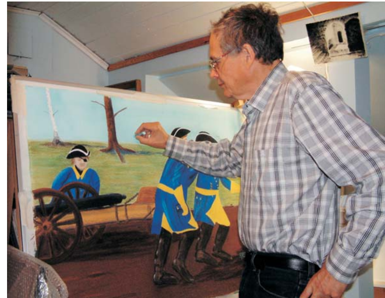
Finishing the "Mystery of War", 2013, pastel on thick paper, 80x100